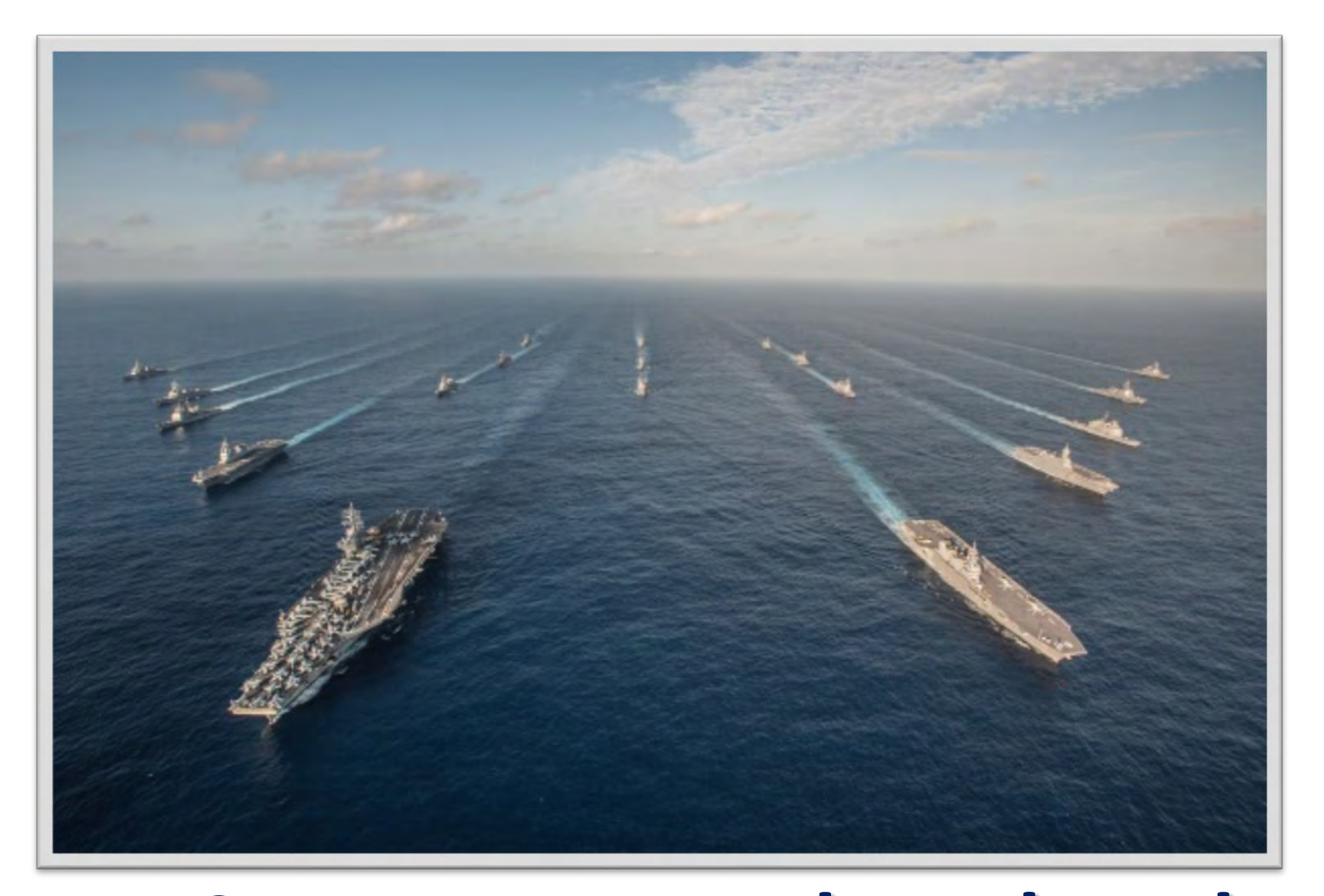
U.S. Navy Forward Deployed